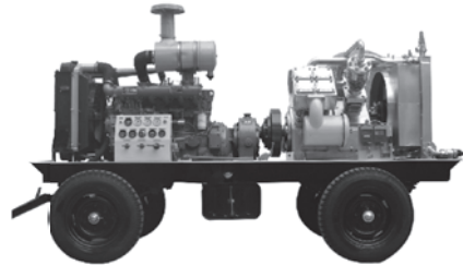
300 CFM COMPRESSOR ELECTRICAL/DIESEL PORTABLE