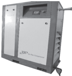
INGERSOL 300 CFM ELECTRICAL SCREW COMPRESSOR