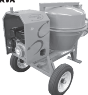
CONCRETE MIXER DIESEL $3000