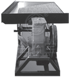
JAMES TABLE (SHAKER) $3 000 1 TON/HR

95 Seke Road (next to ABC Auctions), Tel: 775524, 749316 749323, 0772 329381, 0772 337441, Email: ata@zol.co.zw www.approtechafrika.com