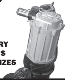
SLURRY PUMPS ALL SIZES