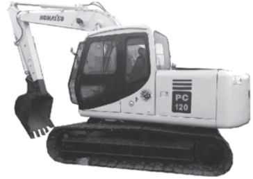
SECOND HAND 12 TON KOMATSU EXCAVATOR $50 000 NEG