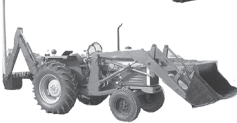
CHINESE TRACTOR 80HP WITH LOADER/DIGGER